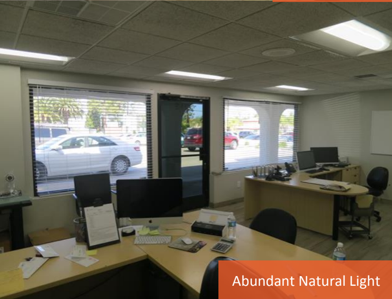
Abundant Natural Light