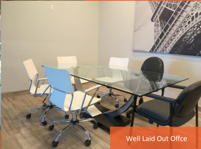
Well Laid Out Office