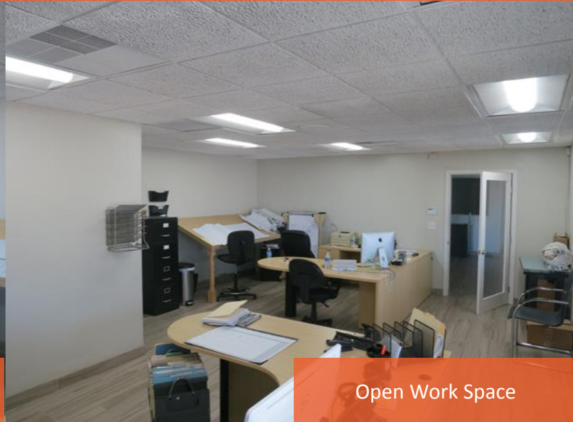
Open Work Space