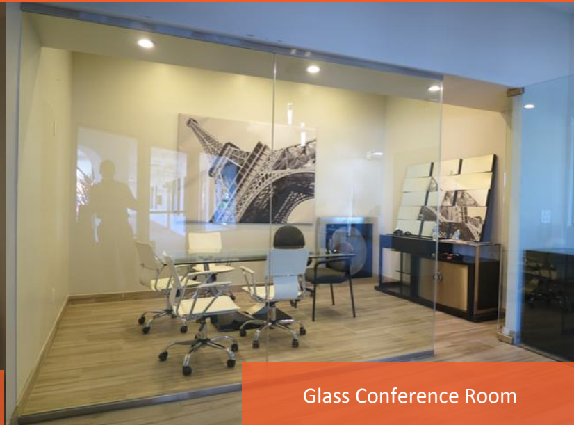
Glass Conference Room